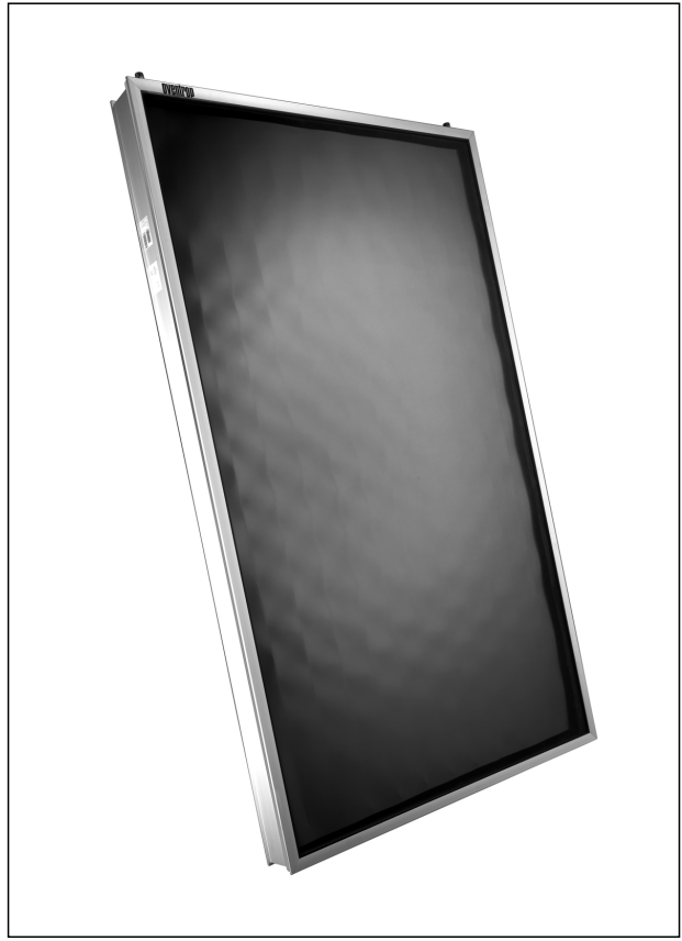
Flat-plate collector OKF